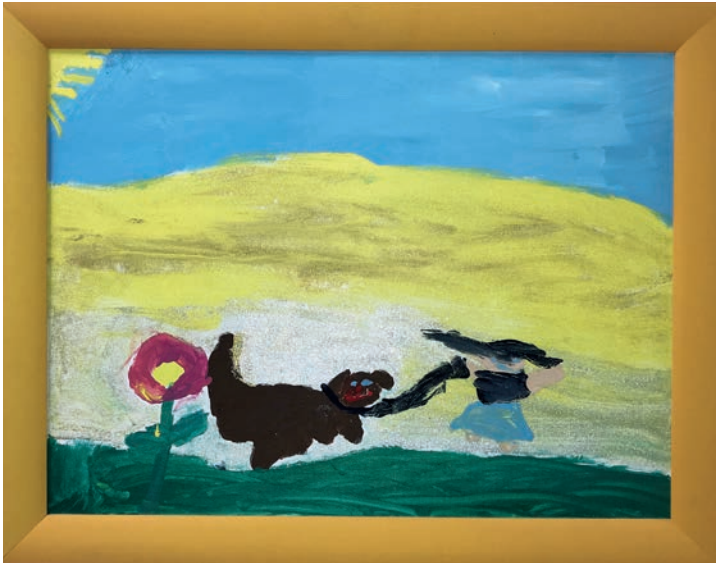
FIGURE 4.4: "MY BACKYARD"