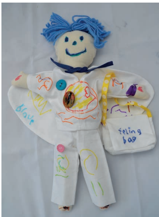
FIGURE 7.2: SUPERHERO THERAPY DOLL