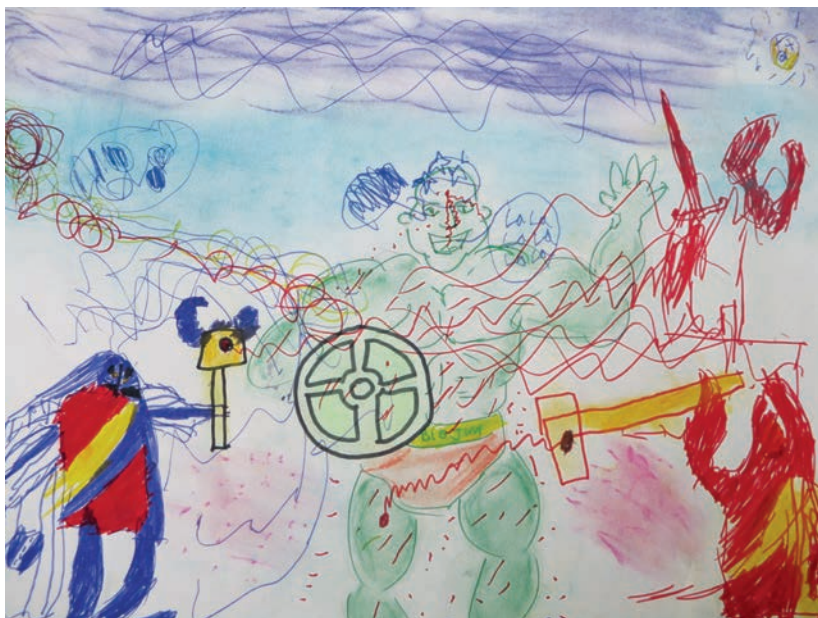
FIGURE 8.2: "BIG JIM"