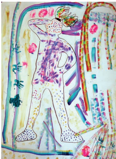
FIGURE 10.3: EMOTIONS SPILLING OVER