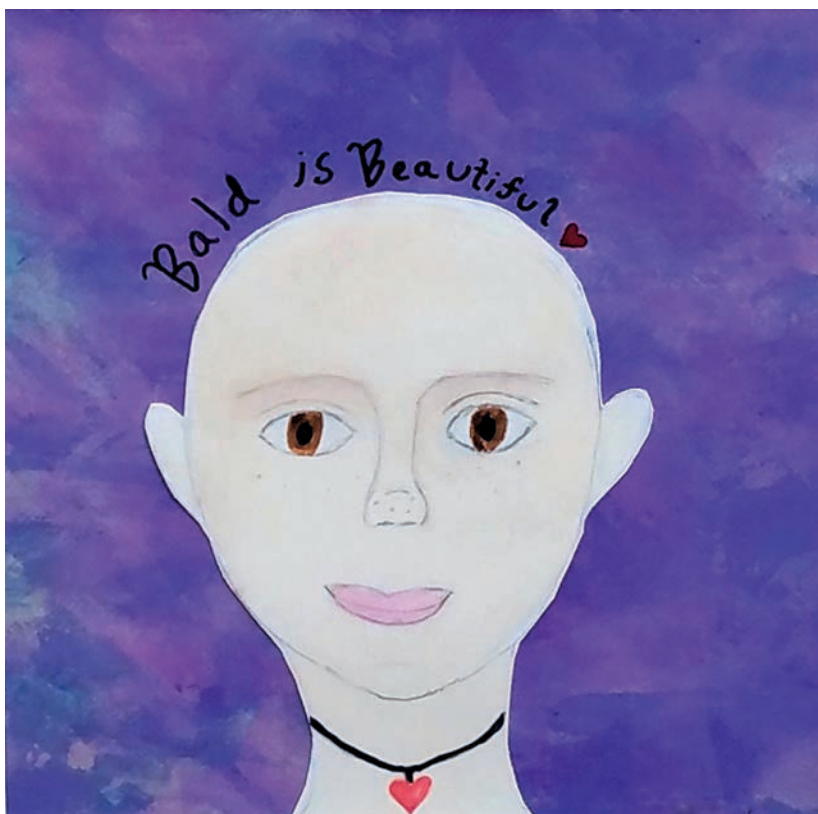
FIGURE 4.2: "BALD IS BEAUTIFUL"