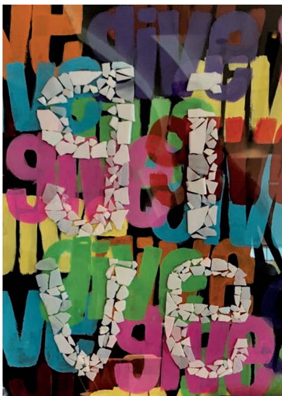
FIGURE 4.8: "GIVE WHAT YOU GET"