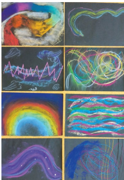
FIGURE 10.5: BREATH DRAWINGS