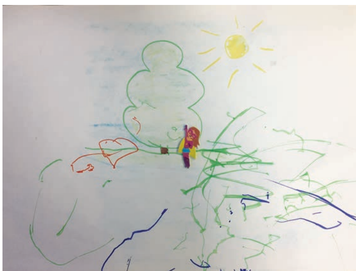
FIGURE 13.2: COLLABORATIVE IMAGE OF RESILIENCE