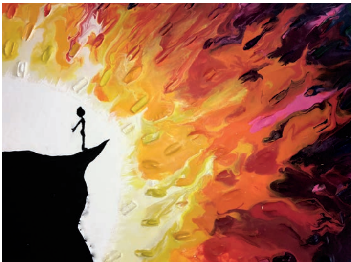
FIGURE 4.7: "WARRIOR"