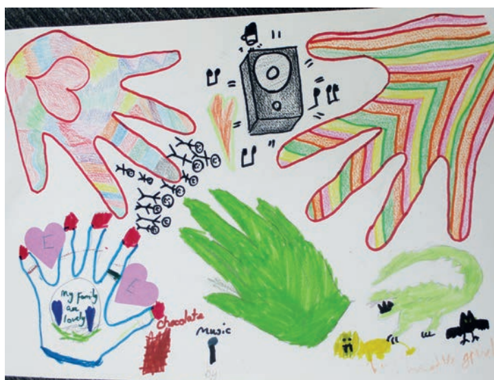
FIGURE 8.1: "FAMILY HANDS"