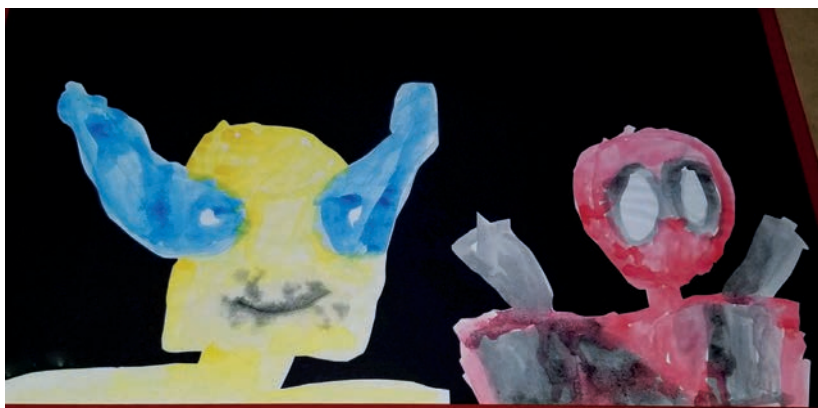
FIGURE 4.3: "THE REGENERATION TEAM"