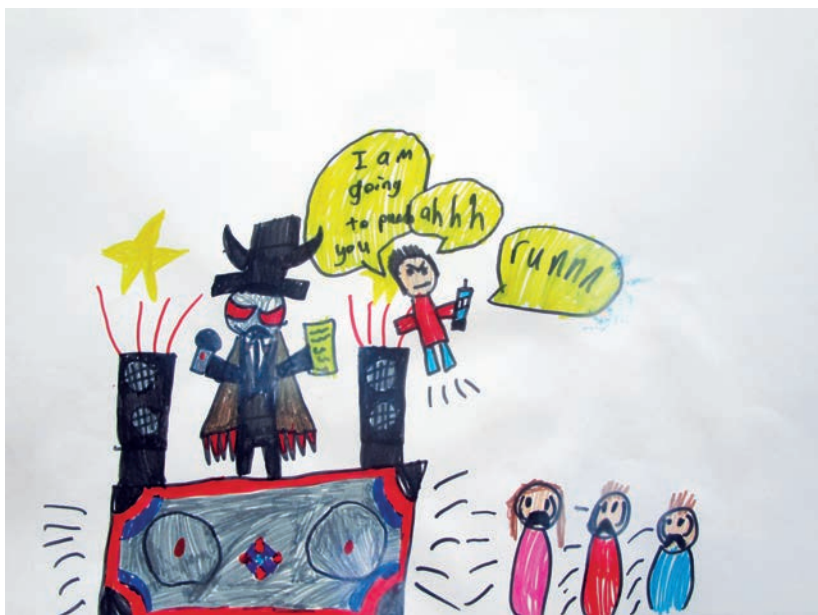
FIGURE 10.1: "THE DARK OVERLORD OF DIABETES"