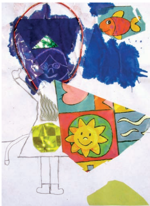
FIGURE 10.4: HALF-HUMAN, HALF-CAT SUPERHERO